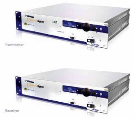
Figure 4: Libera SYNC

With this goal in mind the Libera SYNC system was developed.